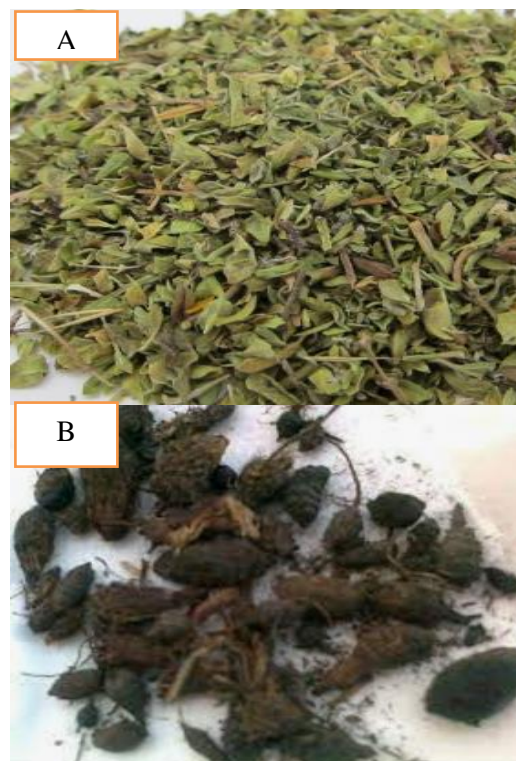
Fig. 1: A; Oregano leaves B; Cyprus leaves

at (4 °C) to avoid the detrimental effects of light until usage (Kulaksiz et al., 2018).